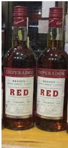
EMPERADOR RED BRANDY